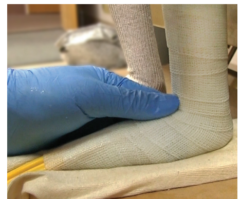
Using the casting pillow

As the tape begins to cure, use your fingers to push in and around all the key landmarks like the malleoli, met-heads, navicular, etc. To capture the plantar surface contours, consider using a casting pillow under your patient's foot. You can easily make your own with open-cell foam and cotton stockinette. We have instructions in the Cascade Library on cascadedrafo.com .