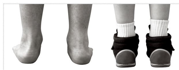
Moderate pronation, unstable foot position.