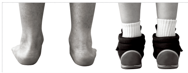
Moderate pronation, unstable foot position.