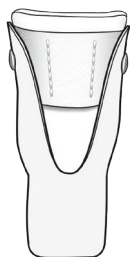
Flexible Dacron strap